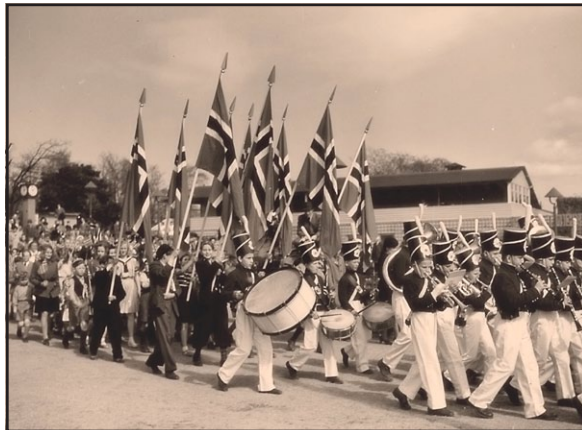
The children's fun at Skansen with the music at the forefront. May 17, 1944.

GRAND FLAG PARADE: Starting at 6 pm (rain or shine!), we will once again have our parade featuring the marching band, as well as a myriad of festively attired participants.